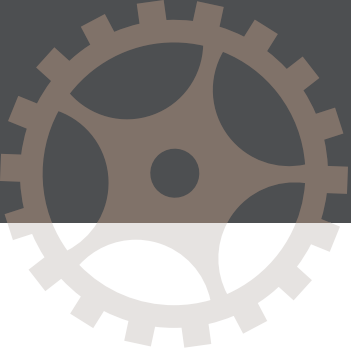
EXHIBIT AREA OPEN OCTOBER 8, 9 & 10